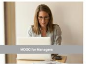
MOOC for Managers

The roll out of the two training courses will take place in January 2024. Stay tuned!