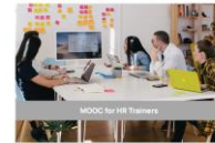
MOOC for HR Trainers